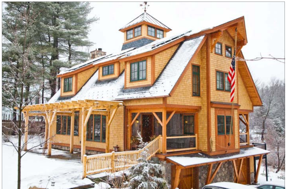
The four-bedroom prefabricated home, received a LEED Silver Certification from the United States Green Building Council for its sustainable design.

A VRV system has the ability to control the amount of refrigerant flowing to each of the system's evaporators, enabling individualized comfort control and superior energy efficiency. The Daikin system includes two, three-ton VRV-S ® outdoor units, whose