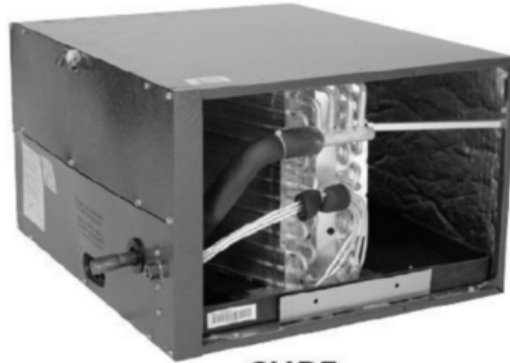
CHPF Horizontal "A"