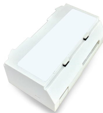
DD15 INNCOM VRV Interface Module