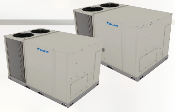
Standard Efficiency DFC | DFG (15 -25 Tons)

Standard Efficiency DFC | DFG | DFH (7½ -12½ Ton, 7½ -10 Ton Heat Pump) High-Efficiency DRC | DRG (7½ -12½ Ton)