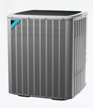
Split System Air Conditioners DX3SEA | DX14XA Split System Heat Pumps DZ4SEA | DZ14XA